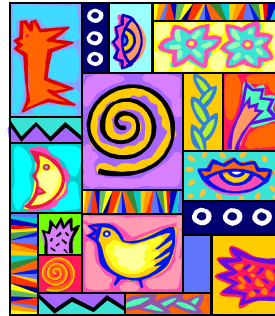
Your chance to quilt your love for Christmas.